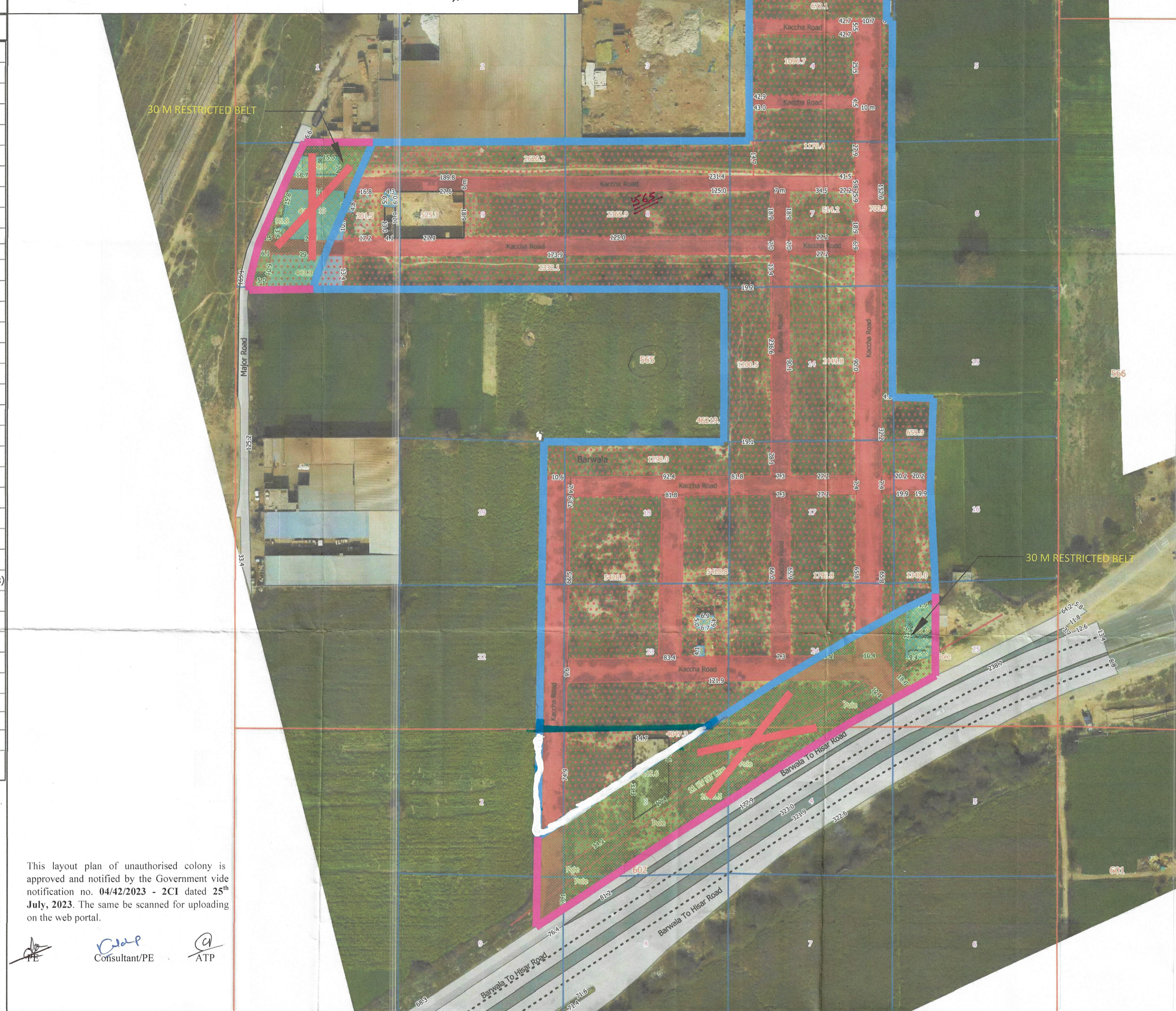
Layout Plan Of Drone Based Survey Krishana Colony ID 13374 Barwala (Hisar)

Total Area Of Colony = 46219.69 sq.m. (11.42 acer) Total Commercial Area=943.30sq.m (0.23 acer) Total Vacant Plot Area= 995.54 sq.m (0.24 acer) Total Vacant Land Area= 32637.55 sq.m (8.06 acer) Total Road Area= 11649.27 sq.m (2.87 acer) Layout Plan At Scale 1:1000 Plots Area Marked in Sq Meters in The Plots. Vacant Length And Width Written in To Plots. Layout Drawn As Overlay To The Satellite Imagery.